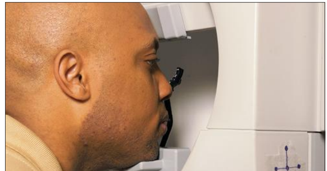
Visual field testing is used to monitor peripheral, or side, vision.

If you need to rest during the test, tell the technician and they will pause the test until you are ready to continue.