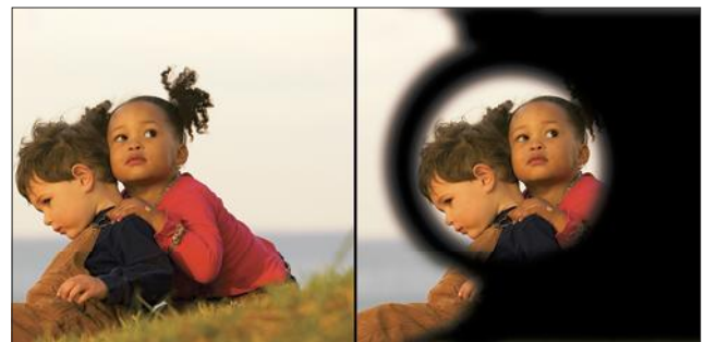
A normal visual field is represented in the image on the left. The image on the right is an example of severely damaged vision.